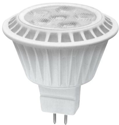
7W 12V MR16